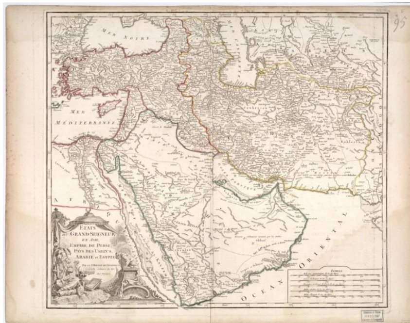
Figure 1 Map- 'Etats du Grand-Seigneur en Asie: Empire de Perse, Pays des Usbecs, Arabie et Egypte' at the repository of Geography and Map Division in the Library of Congress in the United States, Washington; code 2013593001